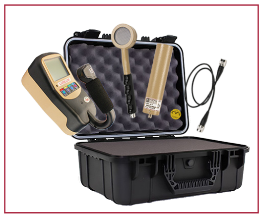
Part Number: 48-4178

SENSITIVITY (137Cs gamma): 3300 cpm/mR/hr