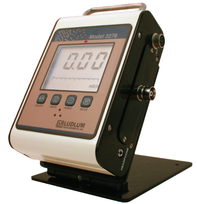
Model 3276 with desktop stand option