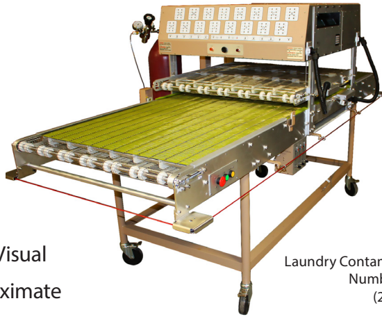
Laundry Contamination Monitor Part Number 48-2113 (2 views)