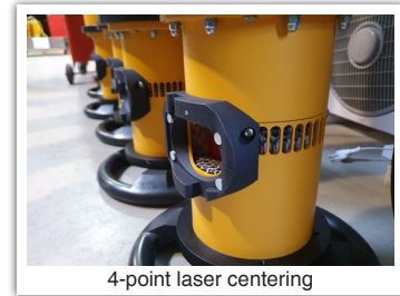
4-point laser centering