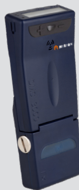
DMC 3000 Telemetry