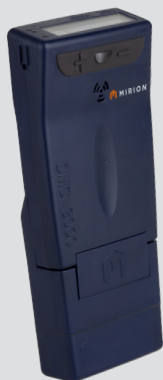
DMC 3000 Neutron