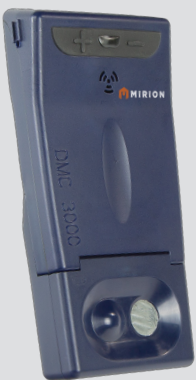
DMC 3000 Beta