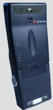
DMC 3000 Neutron Telemetry