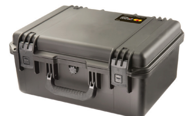
Transport & Storage Case Option