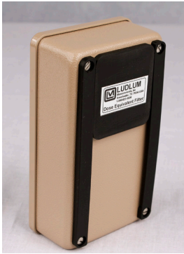
Sliding Dose Equivalent Filter shown closed (above) and open (right).

As most know, the venerable GM pancake has a significant over-response at lower energies between approximately 20 to 160 keV. Any exposure or dose measurements taken with an unfiltered GM pancake detector would thus have unacceptable errors at these lower energies. To counteract this tendency, Ludlum Measurements developed a sliding filter for the Model 2401-P DOSE GM pancake detector that flattens the response to within 20% referenced to 137 Cs (662 keV) over an energy range of 20 keV to 1.2 MeV for ambient equivalent dose measurements.