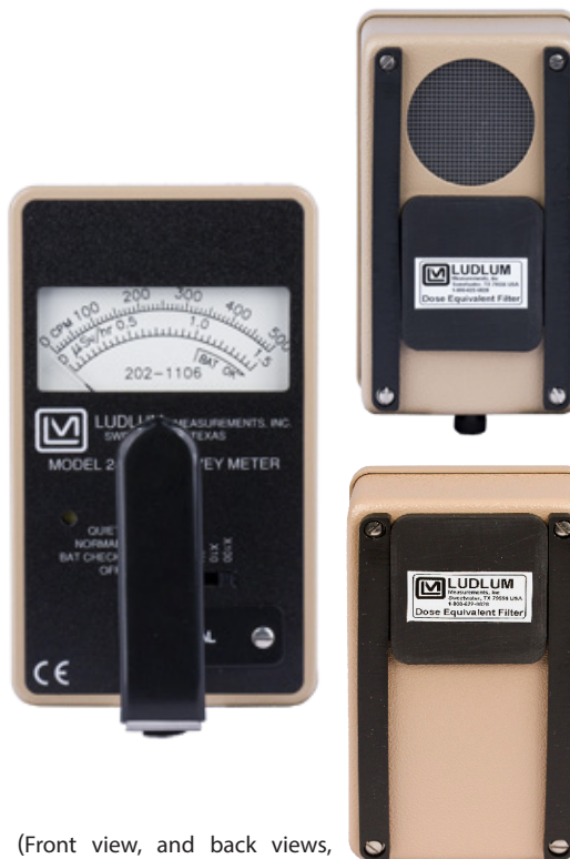
(Front view, and back views, with filter open and closed, of a Model 2401-P DOSE)

An L-shaped stainless steel handle provides a secure and comfortable grip when using the Model 2401-P DOSE as a survey meter. Loosening the knob permits the handle to pivot, allowing the instrument to be easily housed in the included carrying or storage case. This instrument is available with several meter face options for measuring contamination and exposure rate.