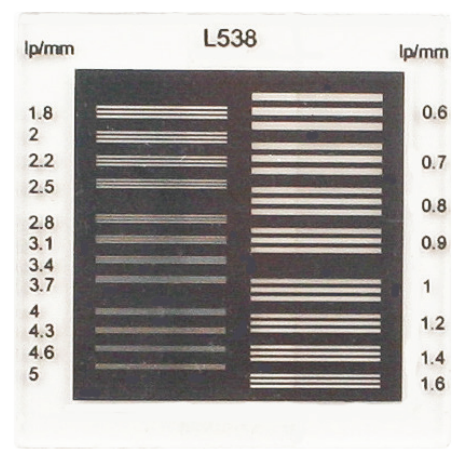
Model L-538 Part Number: 99-9488

Patterns containing two line groups of each resolution value are typically recommended for imaging systems. The groups in these types of patterns (see images) are perpendicular to each other. The patterns are recommended when screen image or video intensifiers are to be tested. It is good practice to place them in various locations covering the entire area of an imaging field.