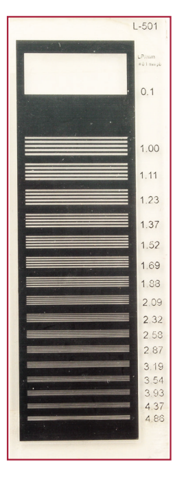
Model L-501 Part Number: 99-9490 Above: enlarged detail of pattern