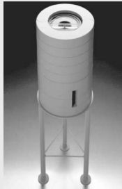
CRC-PS Positron Shield