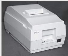
Epson Roll Printer