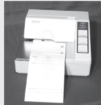
Epson Ticket Printer