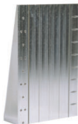
5-Groove Wedge Heavy Metal made of stainless steel

Simple to set-up and use universal test wedge according to ASTM E2737 - available in two versions. Selection shall base on the most stringent material used in the application.