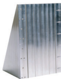
5-Groove Wedge Light Metal made of aluminum