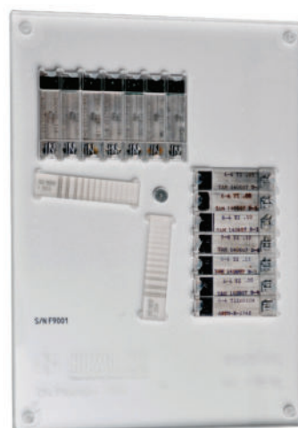
DR Phantom TAM