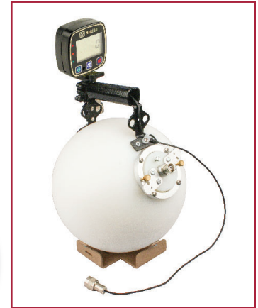
upper left: detail of display unit lower left: base of instrument