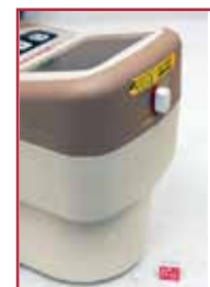
Model 9DP-1 thumb drive

WEIGHT: 1.5 kg (3.3 lb), including batteries