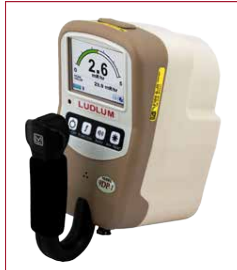
Part No. 48-3899

The Model 9DP-1 is part of Ludlum's new Dimension series of meters employing state-of-the-art technologies that deliver tremendous capability, user friendliness, and convenient PC connectivity. The built-in USB port facilitates password-protected access to parameter settings via direct connection to a USB keyboard (with no additional USB ports, and no integrated mouse or trackpad) thus foregoing any need to install PC application software or dealing with operating system compatibility issues. Ludlum also offers an optional Dimension PC Windows™ interface program that enables total control over the instrument and performs calibration.