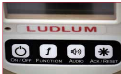
Model 9DP-1 control panel