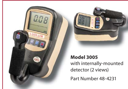
Model 3005 with internally-mounted detector (2 views) Part Number 48-4231